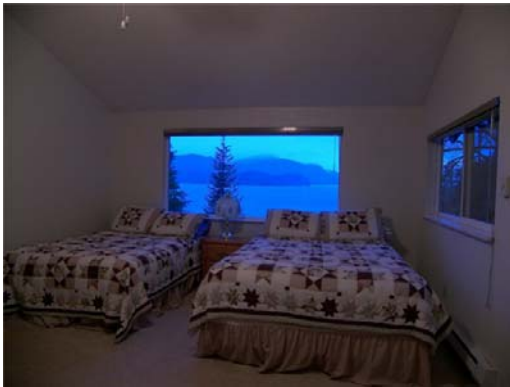
Shot without flash so you could appreciate this view from the third bedroom upstairs.