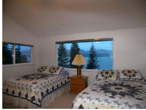
Views from upstairs bedrooms are even prettier.