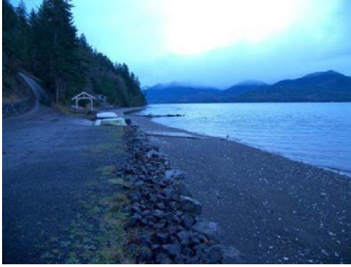
Community beach looking south.

6826 Birdseye View Lp NW , Seabeck 98380