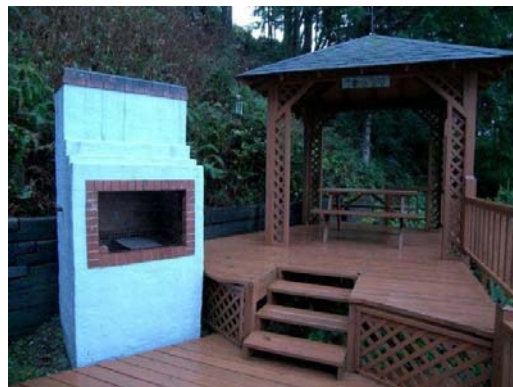
Catch your fish, clean 'em, cook 'em right here, and dine outside...