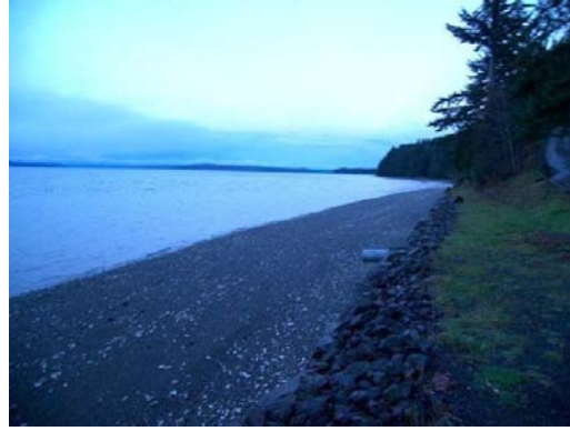
Community beach looking north.