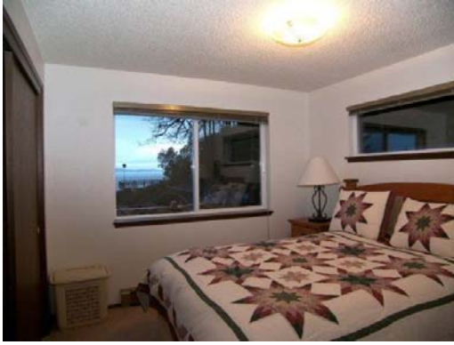
Every bedroom has a great view of the water and the mountains.

6826 Birdseye View Lp NW , Seabeck 98380