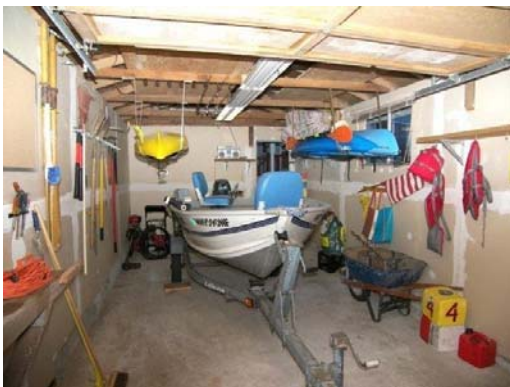
Boats, kayaks, jet skis, scuba, crabbing, fishing-- what's your pleasure?