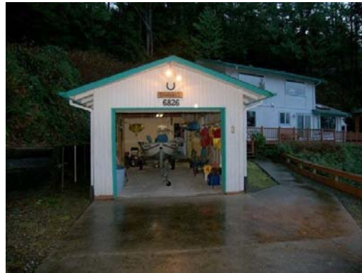
Store your fun-time toys here, more parking across the road on the 2nd parcel.